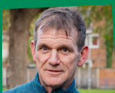
DUSTY GEDGE International Ambassador EFB - European Federation of Green Roof and Wall Associations